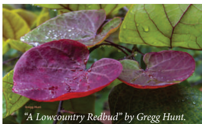
"A Lowcountry Redbud" by Gregg Hunt.

The Open Land Trust will be selling the 2015 Preservation Calendar for $15, available by late November. Contact us today to reserve your calendar for a year of support!